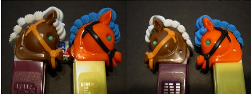
Loose fit on fake, snug on real small eye fake

Ponies – the first and most obvious thing to look for is the fit of the mane. It should fit snugly around the head of the pony. Look also at the size of the eyes. The fake pony eyes are much smaller. Check the fit of the bridle – it should fit snugly in place around the nose.