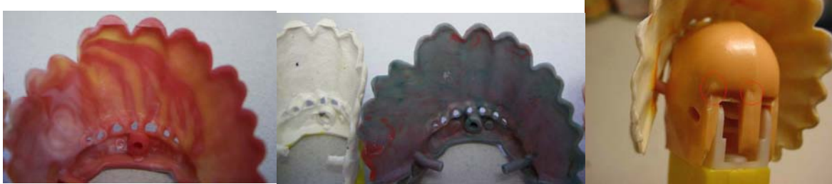
Flat edge on real headdress flat no flat edge on fake fake has bump

Indian Chief – the most easily visible distinction is the flat edge that should be seen on the back of the headdress. The fake does not have the flat edge, it is all evenly rounded. If marbled, the colors should flow together, not have clumps or strings of color. Also look for the bump at the left corner on the head just above the sleeve, and the straight, angled off candy kicker.