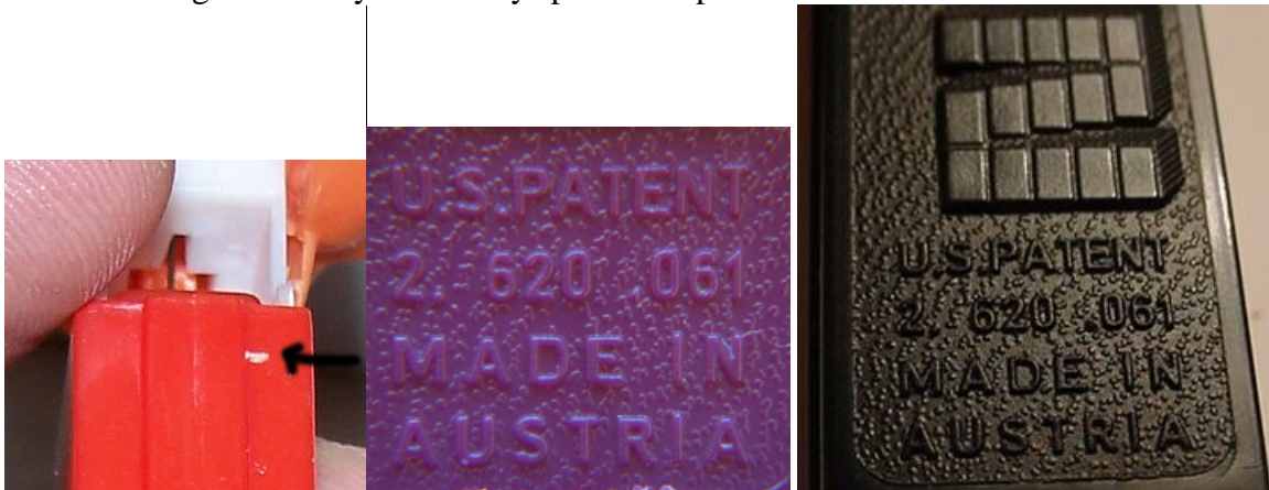
Nick on stem

2.6 Austria stems – there are two different versions of the fakes. One has a nick mark 1/8” below the top edge on the right as you look at it, just beside the center seam ridge. There is also a nick on the back of the stem, approximately half way down, on the left of the center seam on the ridge. The pebbling is distinctly different but harder to see than on the second version which is most distinguishable by the widely spaced dot pattern.