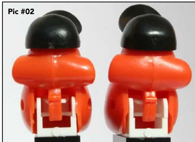
Picture #2: The fake mimic is on the left, the real on the right. You can see mold left-overs on the vertical sides to the left and right of the candy pusher. Also, the two halves that make up the face do not line up as well as the real one. Take a look at the caps. The one has a mold marking at the bottom, where the real cap has one above the bottom, almost in the center of the back. This was consistent with all other specimens I came across.