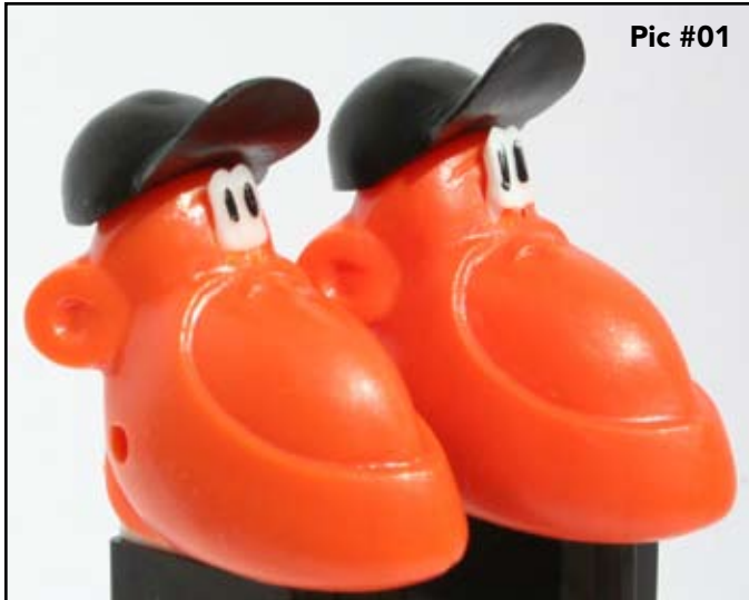
Picture #1: The fake mimic is on the left, the real one the right. The fake one has a shininess to it that is somewhat visible when photographing- you can see it in the sun spot to the left of the eyes. Also note the color of the eyes. The fake mimic has a milky-white look to it where the real one is solid white and more pure.

"I was able to get a couple snap shots for you comparing the fake Mimic to a real one. The real one showed the same consistencies as all the other Mimics I own. The images are large to show detail. You may resize and crop as needed." — Tim Bentley